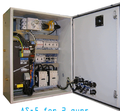
AS-5 for 2 guns