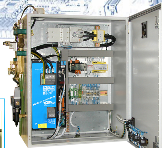
AS-5 Vesion 10kHz