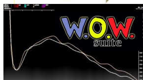
WOW: tracking a pattern